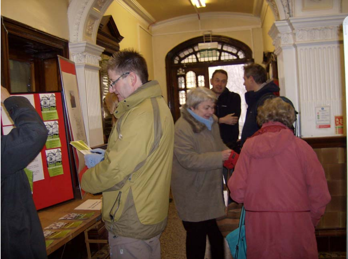
Visitors at the drop-in session held at Hebden Bridge Council Offices on December 15 th .